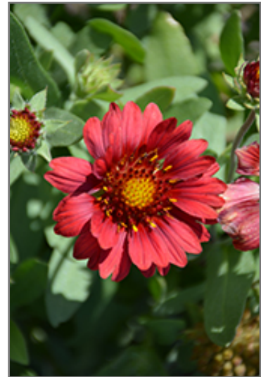
Mesa Red Blanket Flower flowers