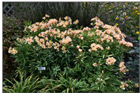
Inca Ice Alstroemeria in bloom