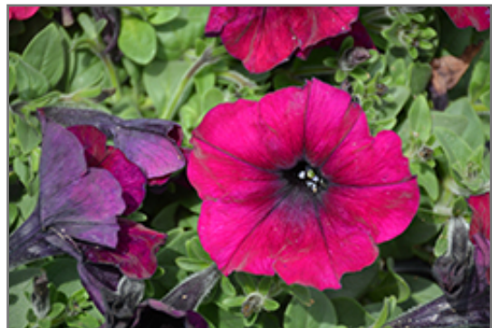
Easy Wave Burgundy Velour Petunia flowers