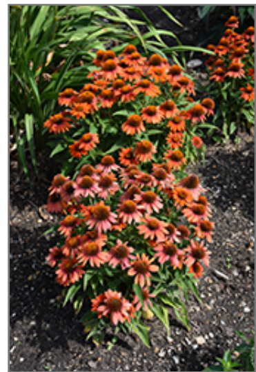
Sombrero Adobe Orange Coneflower in bloom