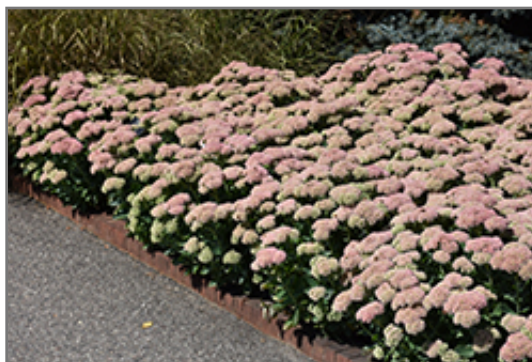
Autumn Joy Stonecrop in bloom