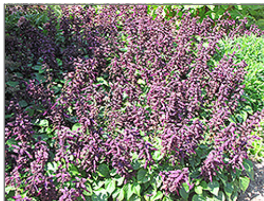
Vista Purple Sage in bloom