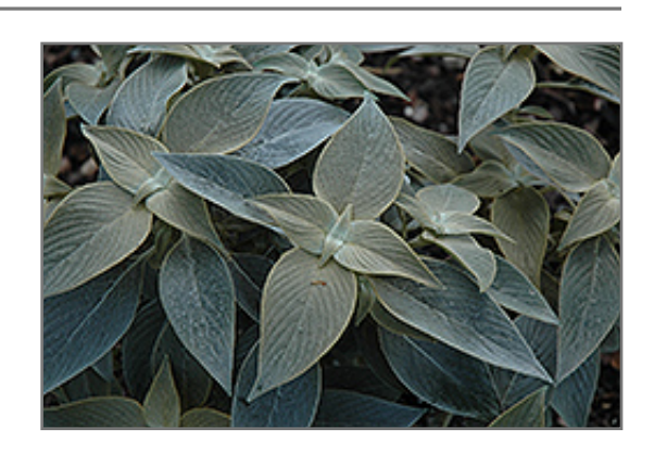
Persian Shield foliage

Persian Shield will grow to be about 3 feet tall at maturity, with a spread of 3 feet. It has a low canopy. It grows at a fast rate, and under ideal conditions can be expected to live for approximately 10 years.