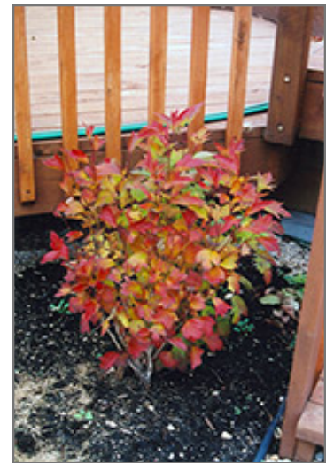
Compact Highbush Cranberry in fall