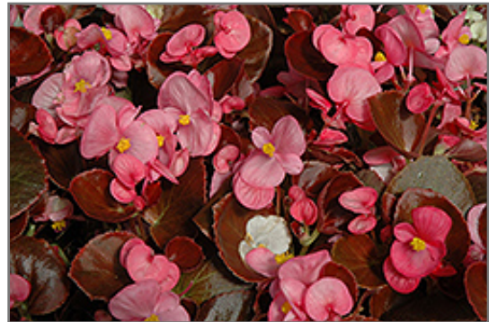
Nightife Rose Begonia flowers

Nightife Rose Begonia is recommended for the following landscape applications;