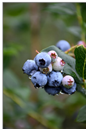
Chippewa Blueberry fruit

This is a multi-stemmed deciduous shrub with an upright spreading habit of growth. Its relatively fine texture sets it apart from other landscape plants with less refined foliage. This is a relatively low maintenance plant, and usually looks its best without pruning, although it will tolerate pruning. It is a good choice for attracting birds to your yard. It has no significant negative characteristics.