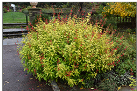
Golden Delicious Pineapple Sage in bloom