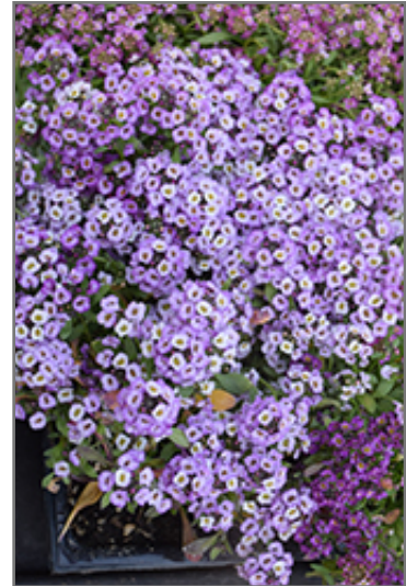
Clear Crystal Lavender Shades Sweet Alyssum flowers

Clear Crystal Lavender Shades Sweet Alyssum is recommended for the following landscape applications;