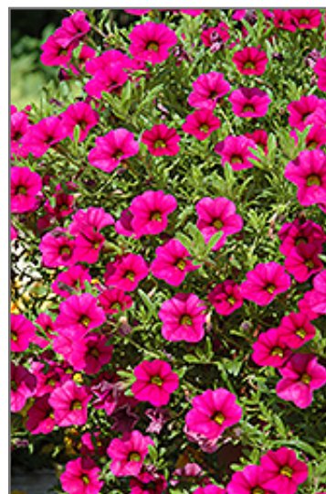
Cabaret Rose Calibrachoa flowers