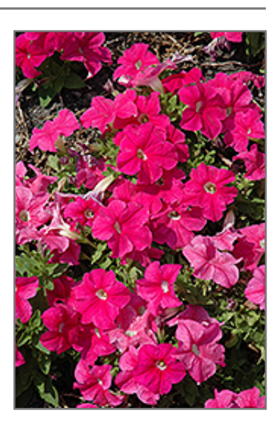
Pretty Grand Deep Pink Petunia flowers

Pretty Grand Deep Pink Petunia will grow to be about 8 inches tall at maturity, with a spread of 12 inches. When grown in masses or used as a bedding plant, individual plants should be spaced approximately 10 inches apart. Its foliage tends to remain low and dense right to the ground. This fast-growing annual will normally live for one full growing season, needing replacement the following year.