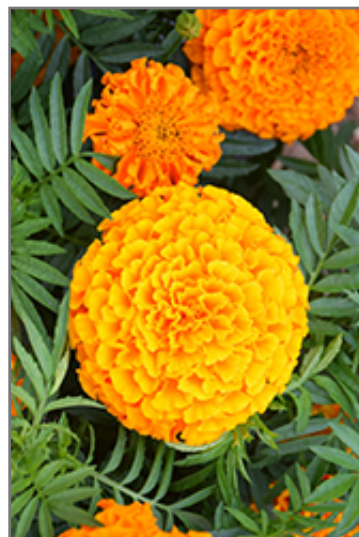
Taishan Orange Marigold flowers

Taishan Orange Marigold will grow to be about 12 inches tall at maturity, with a spread of 10 inches. When grown in masses or used as a bedding plant, individual plants should be spaced approximately 8 inches apart. Its foliage tends to remain dense right to the ground, not requiring facer plants in front. This fast-growing annual will normally live for one full growing season, needing replacement the following year.