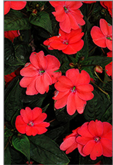
SunPatiens Compact Coral New Guinea Impatiens flowers