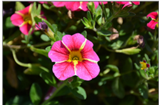
Superbells Cherry Star Calibrachoa flowers

This plant will require occasional maintenance and upkeep. Trim off the flower heads after they fade and die to encourage more blooms late into the season. It is a good choice for attracting bees and hummingbirds to your yard, but is not particularly attractive to deer who tend to leave it alone in favor of tastier treats. It has no significant negative characteristics.