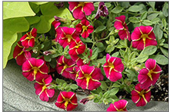
Superbells Cherry Star Calibrachoa flowers

Superbells Cherry Star Calibrachoa is a fine choice for the garden, but it is also a good selection for planting in outdoor containers and hanging baskets. Because of its trailing habit of growth, it is ideally suited for use as a 'spiller' in the 'spiller-thriller-filler' container combination; plant it near the edges where it can spill gracefully over the pot. Note that when growing plants in outdoor containers and baskets, they may require more frequent waterings than they would in the yard or garden.