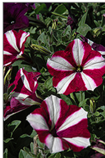
Easy Wave Burgundy Star Petunia flowers

Easy Wave Burgundy Star Petunia is recommended for the following landscape applications;