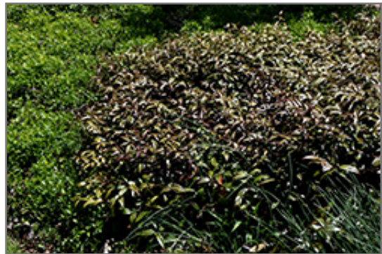
Scarletta Fetterbush