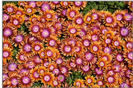
Fire Spinner Ice Plant in bloom