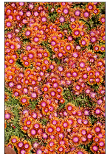
Fire Spinner Ice Plant flowers