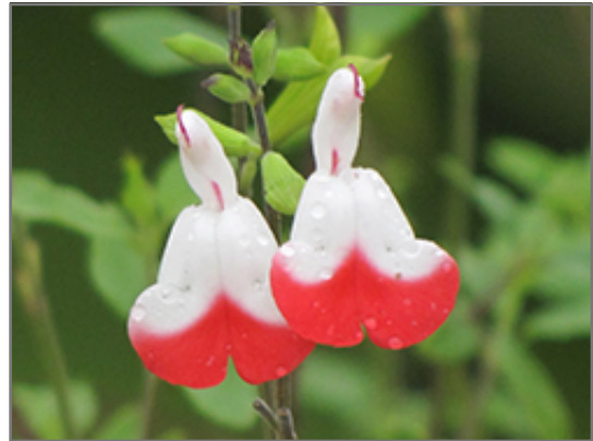
Hot Lips Sage flowers

Hot Lips Sage is recommended for the following landscape applications;