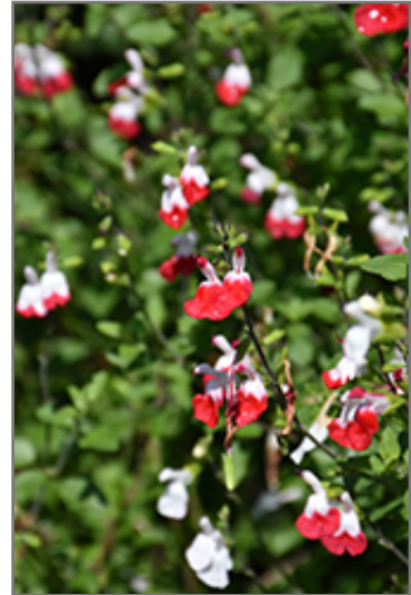
Hot Lips Sage flowers

Hot Lips Sage is a fine choice for the garden, but it is also a good selection for planting in outdoor pots and containers. With its upright habit of growth, it is best suited for use as a 'thriller' in the 'spiller-thriller-filler' container combination; plant it near the center of the pot, surrounded by smaller plants and those that spill over the edges. It is even sizeable enough that it can be grown alone in a suitable container. Note that when growing plants in outdoor containers and baskets, they may require more frequent waterings than they would in the yard or garden.