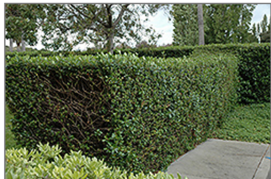
Red Escallonia