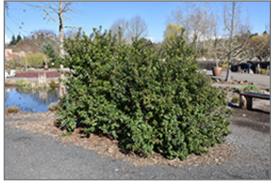
Red Escallonia

This shrub does best in full sun to partial shade. It does best in average to evenly moist conditions, but will not tolerate standing water. It is not particular as to soil type or pH, and is able to handle environmental salt. It is somewhat tolerant of urban pollution. This species is not originally from North America.