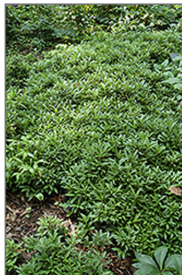
Dwarf Sweet Box